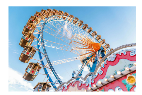
THEME PARKS & ENTERTAINMENT