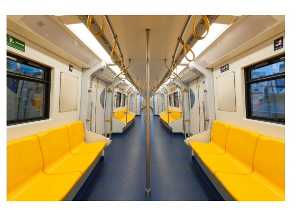
METRO & RAILS