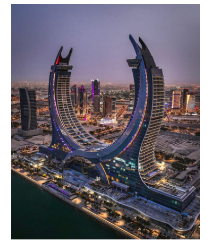
LUXERY HIGH END

Residential | Commercial | Health | Educational | Leisure | Technology | Defense | Religious | Green Buildings | Sports Facilities