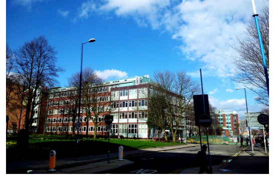
SCHOOLS AND UNIVERSITIES