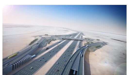
ROADS, BRIDGES & HIGHWAYS

Infrastructure: Roads | Drainage | Metro Rail | Aviation | Marine | Water | Parks & Beautification | Renewable Energy