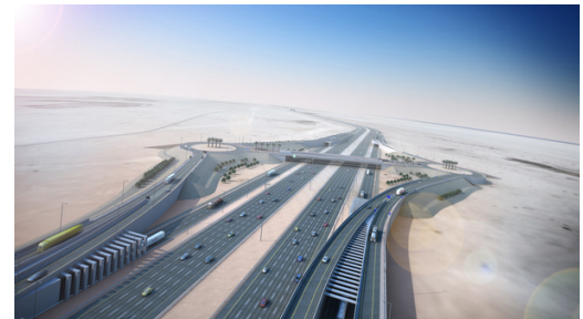
ROADS , BRIDGES & HIGHWAYS

Infrastructure : Roads | Drainage | Metro Rail | Aviation | Marine | Water | Parks & Beautification | Renewable Energy