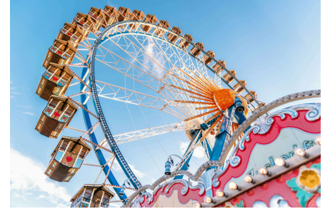
THEME PARKS & ENTERTAINMENT