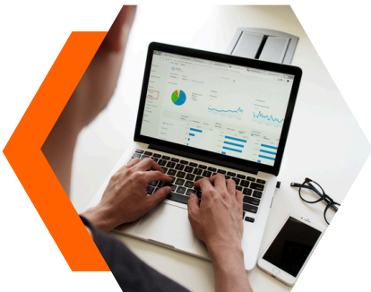
QUANTITY SURVEYING & COMMERCIAL MANAGEMENT

In an incredibly developing and rapidly changing market condition, construction & engineering projects has to be procured & executed as effectively as possible minimizing construction costs & time, as experienced consultants we are aware of the inherent risks and opportunities that exists within a construction & engineering project, we utilize our extensive expertise to ensure smart administration of project cost and maximize construction business potential throughout planning, designing, procurement, construction and throughout taking over and final completion of the project.