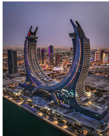
LUXURY HIGH END

Residential | Commercial | Health | Educational | Leisure | Technology | Defense | Religious | Green Buildings | Sports Facilities