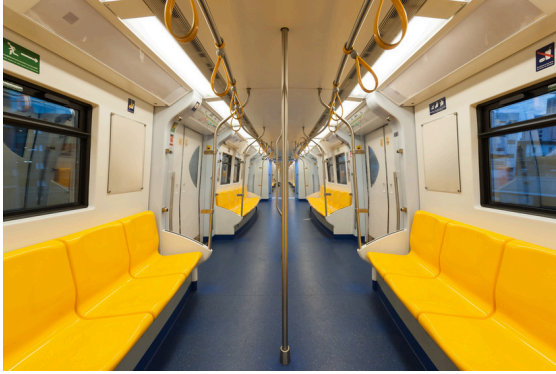
METRO & RAILS