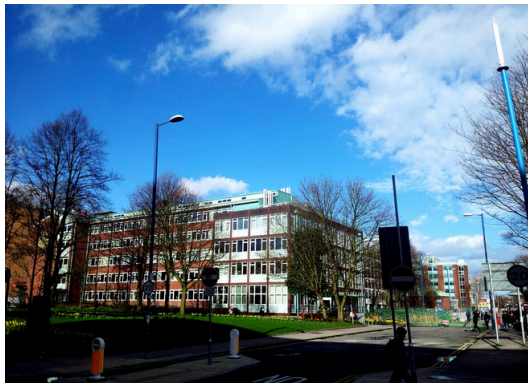
SCHOOLS AND UNIVERSITIES